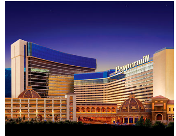
WGMS 2013 Roundtable will take place at the Peppermill Hotel & Convention Center in Reno, NV

Peppermill Hotel & Convention Facilities 2707 South Virginia Street Reno, Nevada 89502 USA Phone: (800) 282-2444 www.peppermillreno.com